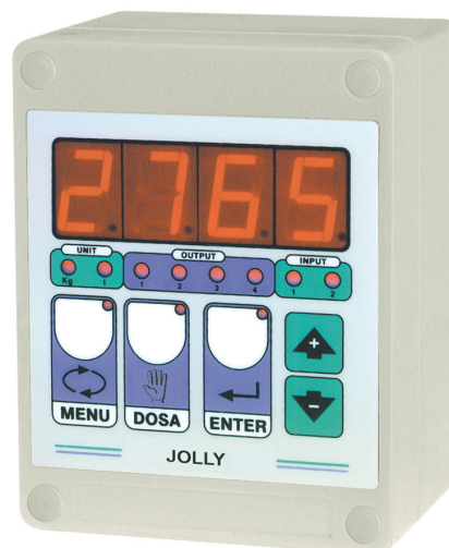
Box for wall mounting (on request) IP64 protection rating