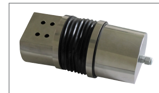
LOAD CELL PROTECTION KIT included for capacities from 60 to 300 kg