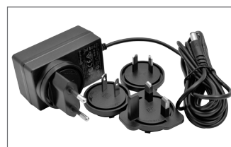
Universal power supply included 24 VDC/1 A - 100÷240 VAC input 3 m cable length