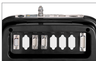
D-SUB connectors - IP40