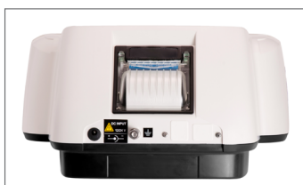
Integrated thermal printer (on request)