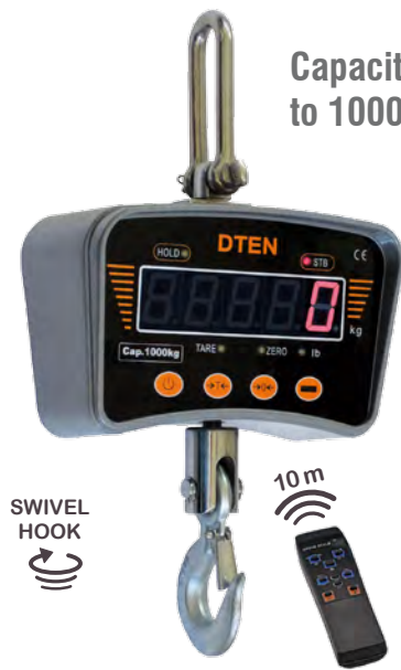
Capacity from 500 kg to 1000 kg