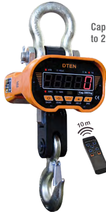
Capacity from 3000 kg to 20000 kg